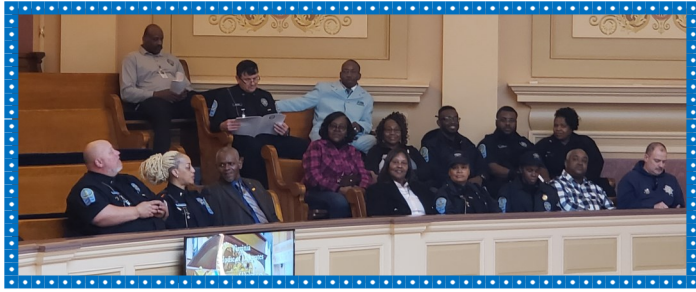
General Assembly—Officers in the Gallery

The General Assembly session is underway, and WE ARE THERE! Our fulltime lobbyists, union representatives and members like you are walking the halls of the General Assembly daily, educating our legislators on what it takes to work in corrections, fighting for increased wages, improved working conditions, and a grievance process that allows for us to be represented fairly and effectively. If we're not there telling our stories, we will be left behind.